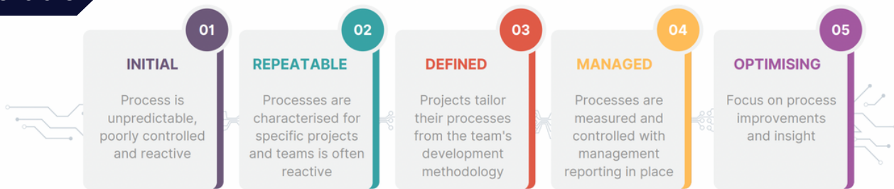
CMMI model showing stages of process or organisational maturity