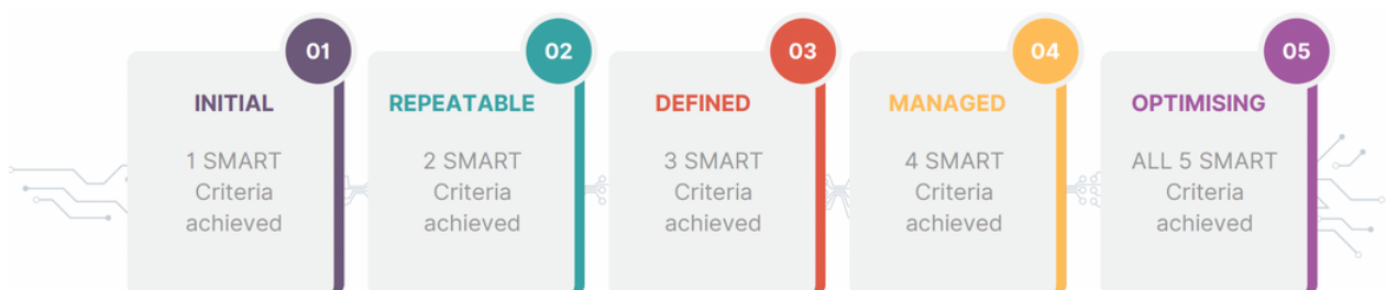
Using the CMMI model to score contractual clause maturity

In the example shown below, one axis and scale work in conjunction with the other axis to provide four clear groups where we can overlay expected outcomes and recommended activity to improve the chance of success and thus the value perceived in the initial business case. The optimal situation is one where there is a fully defined capable team or set of teams where there is a high level of maturity against repeated delivery of the scope of products and services as